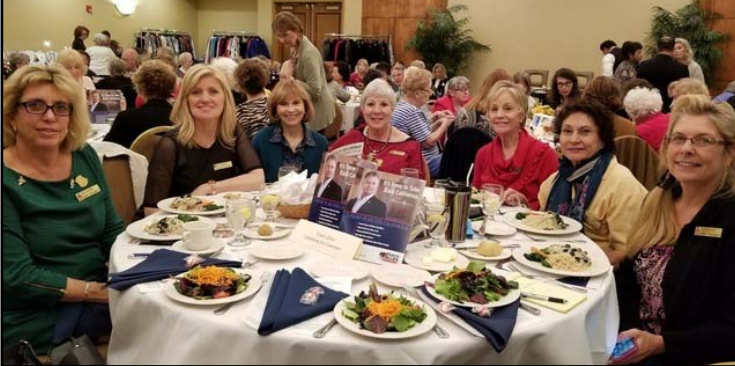
SCARWF attends Southern Division Meeting Candidates Forum March 7, 2018